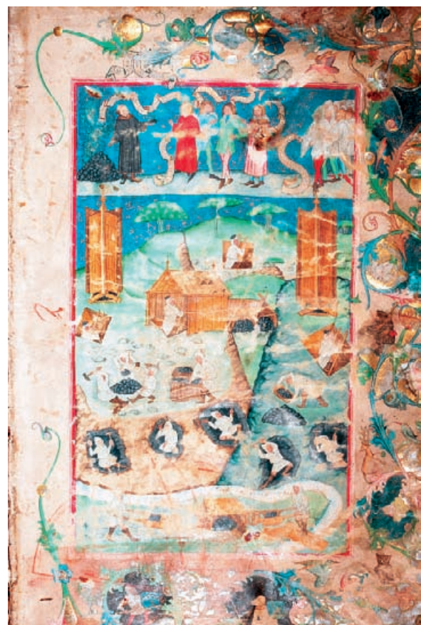
Fol. 1r: A scene with miners

The estimated price of the artistic copy is 500,000 CZK.