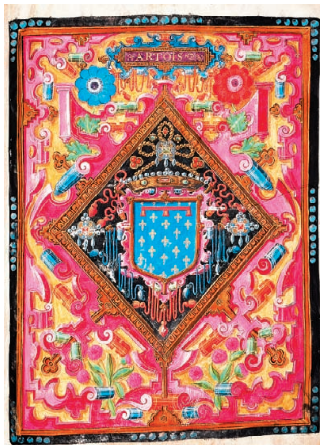
Fol. 4r: The coat-of-arms of the town of Artois

The estimated price of the artistic copy is 420,000 CZK.