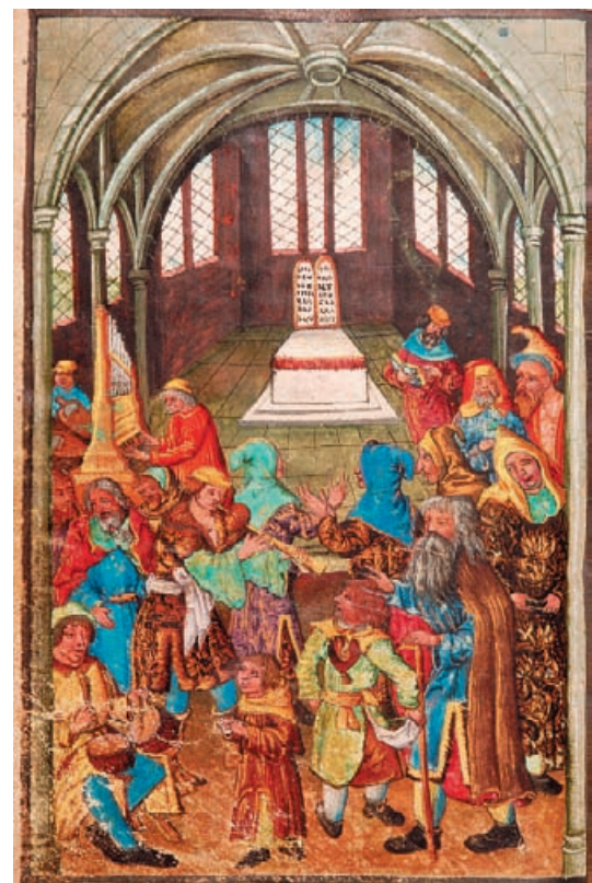
Fol. 110v: A scene in a synagogue

The estimated price of the artistic copy is 370,000 CZK.