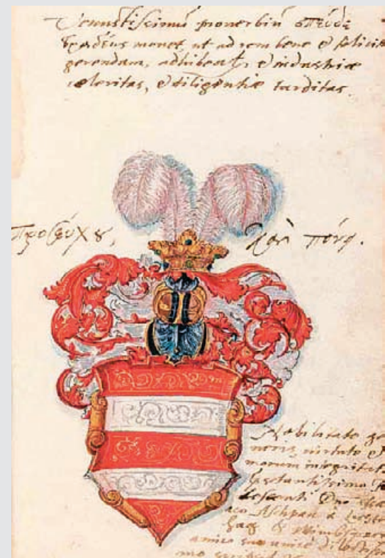
Fol. 13r: The coat-of-arms of Václav Budovec of Budov

The estimated price of the artistic copy is 250,000 CZK.